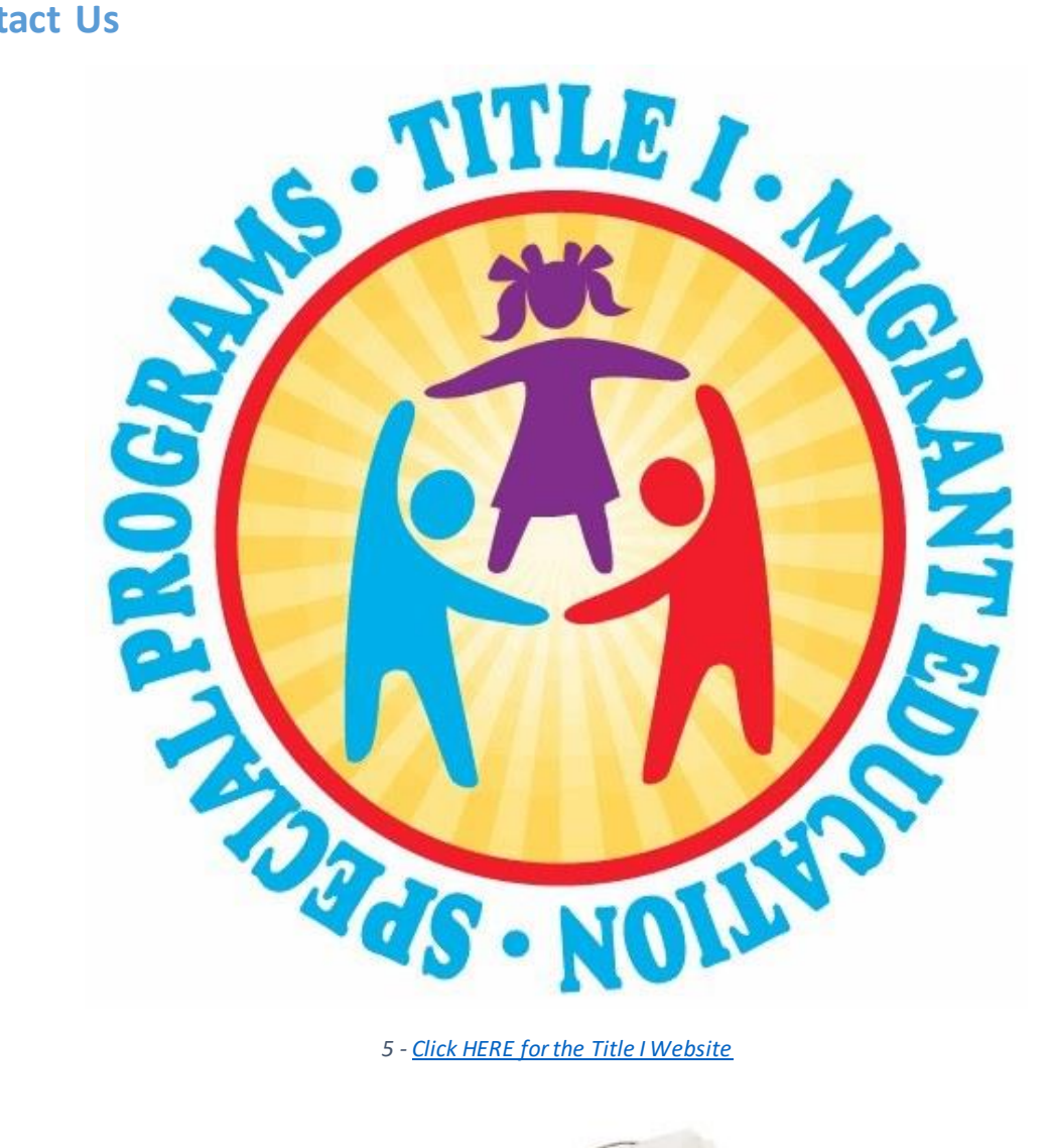
5 - <u>Click HERE for the Title I Website</u>