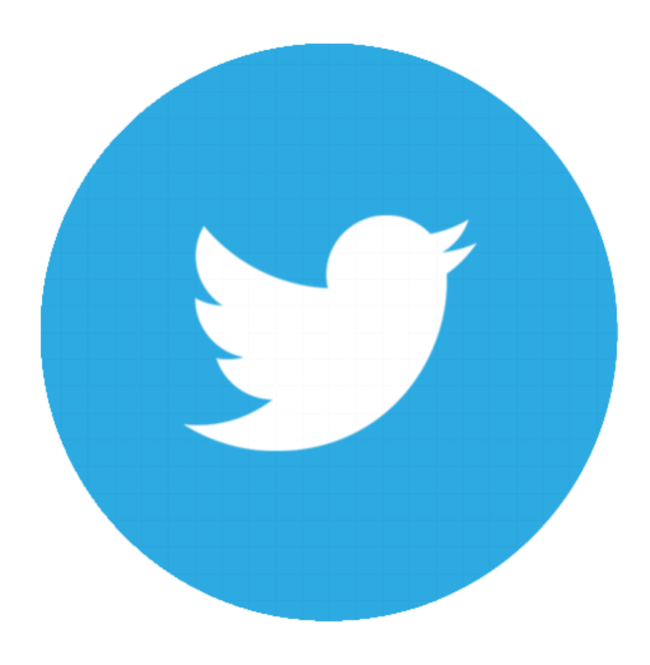
8 - <u>Twitter @BrowardTitleI</u>